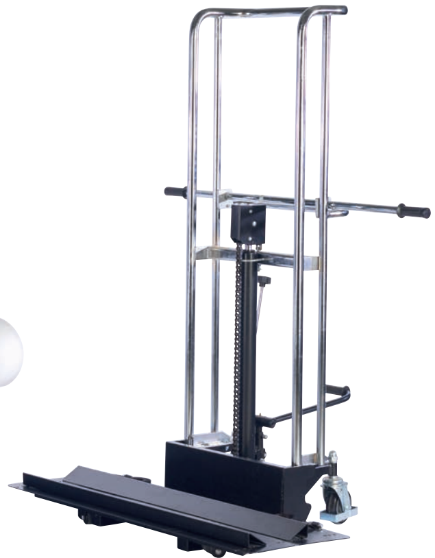
RollJack Manual CPR4080-1350