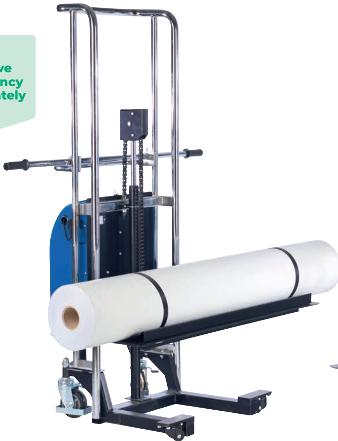
RollJack Electrical EPR4080-1350